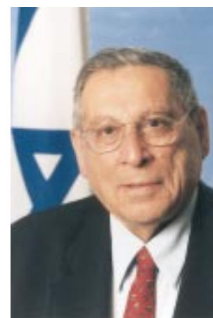
RECHAVAM ZEEVI Moledet founder assassinated in 2001

As we are told: “And I will give peace in the Land, and you shall lie down, and none shall make you afraid; and I will remove evil beasts from the land, and the sword shall not go through your Land..” (LEVITICUS, 26:6)