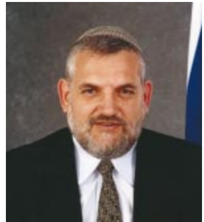
BINYAMIN (BENNY) ELON

Moledet has an active grassroots network, involving adults and youth from all parts of the country. Activists include the religious and secular, young and old, bound together by a unique faith and the belief in the power to take charge of our destiny.